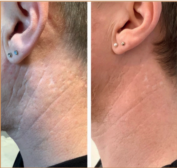
Eden Clinic, Kensington, London 1 Treatment, 0.8J