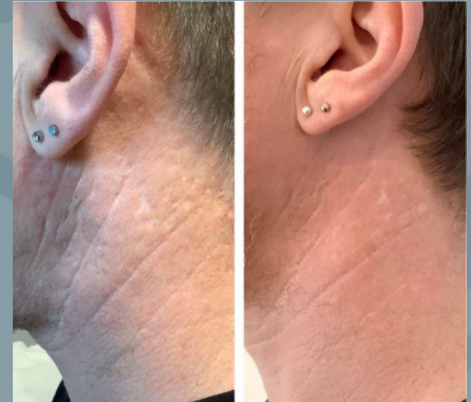
Eden Clinic, 1 Treatment 0.8J Photos taken 1 week apart