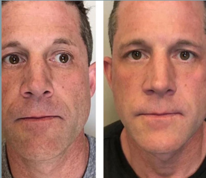
Incrementus, 1 Treatment 2J Photos taken 4 weeks apart