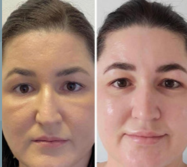
Incrementus, 1J treatment. Photos taken 6 weeks apart.