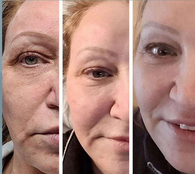
Emergent Medical Technologies, 2 Treatments 1J, Photos taken 4 weeks apart